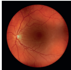
View of a retina through a cataract with visionBOOST**

Up to now, when the front of the eye was clouded by media opacities, such as a cataract, the retina could not be viewed or only to a limited extent.