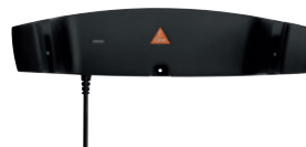
CW1 wall charger [05]