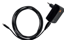
E4-USBC power supply with cable [04]